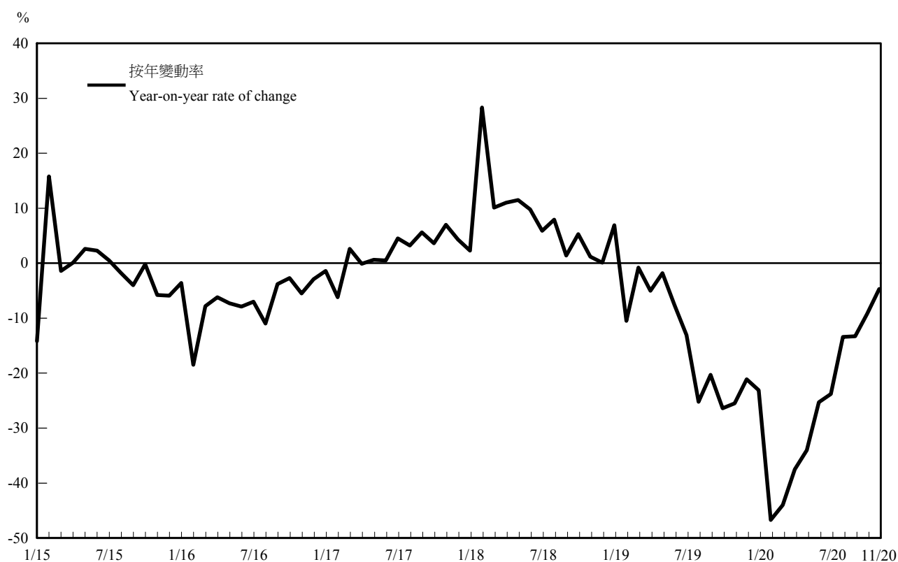
Chart 2 : Movement of volume index of total retail sales